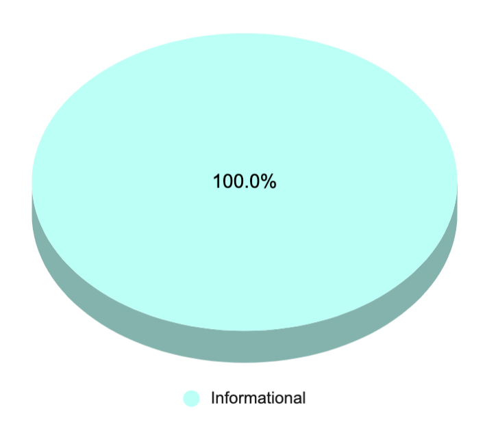
Graph 1. The distribution of vulnerabilities after the first review.

Security engineers found 1 recommendation during the first review.