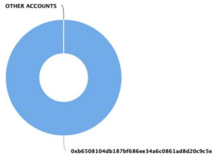
Pluton X Top 100 Token Holders

(A total of 100,000,000.00 tokens held by the top 100 accounts from the total supply of 100,000,000.00 token)